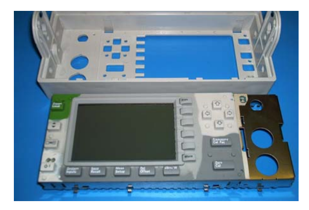
Figure 2 Figure 3

4. The Rubber Keypad is attached to the EMI Screen by 4 rubber mounting lugs. These can be disengaged by carefully pulling the four corners of the Rubber Keypad away from the EMI Screen. Figure 4 shows a picture of one of these lugs.